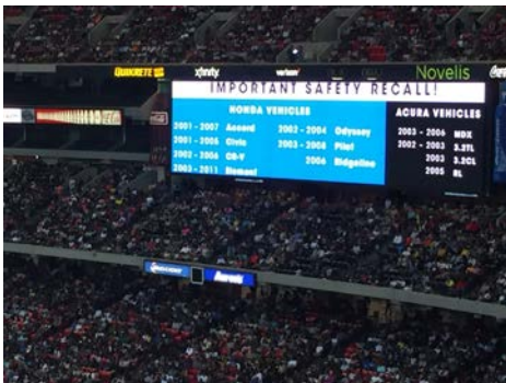
A recall message was displayed on the stadium video board at the 2016 Honda Battle of the Bands, an event attended by 63,000+ in Atlanta, Georgia.

Full page ads in English and Spanish newspapers are designed to grab readers' attention and urge them to get their vehicles repaired.